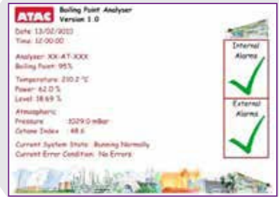
Figure 2: Boiler LCD display