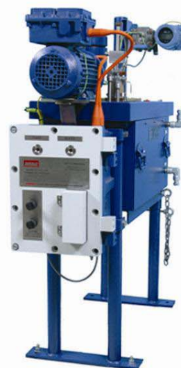
Model 491 wide bore viscometer

As d , Q and L are constants, the absolute viscosity ( \mu ) is directly proportional to the differential pressure measured across capillary ( P ). A precision pump meters sample flow and two heat exchangers, fitted either side of the metering pump, ensure the sample metered by the pump is at approximately the same temperature as sample entering the capillary. Input pressure is set so that the metering pump suction pressure is always positive. The sample flows at a constant rate through the capillary across which a differential pressure transmitter is connected.