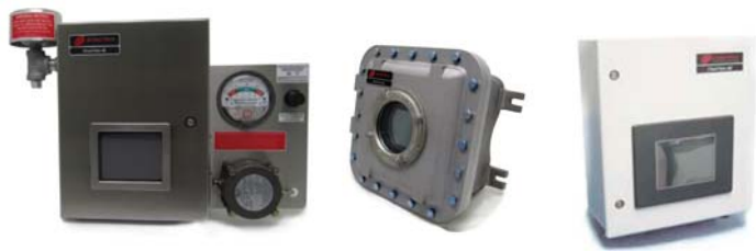
Z-purge Unit Class I, Division 2